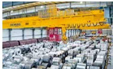
Coil handling and processing at Welser in Ybbsitz, Austria