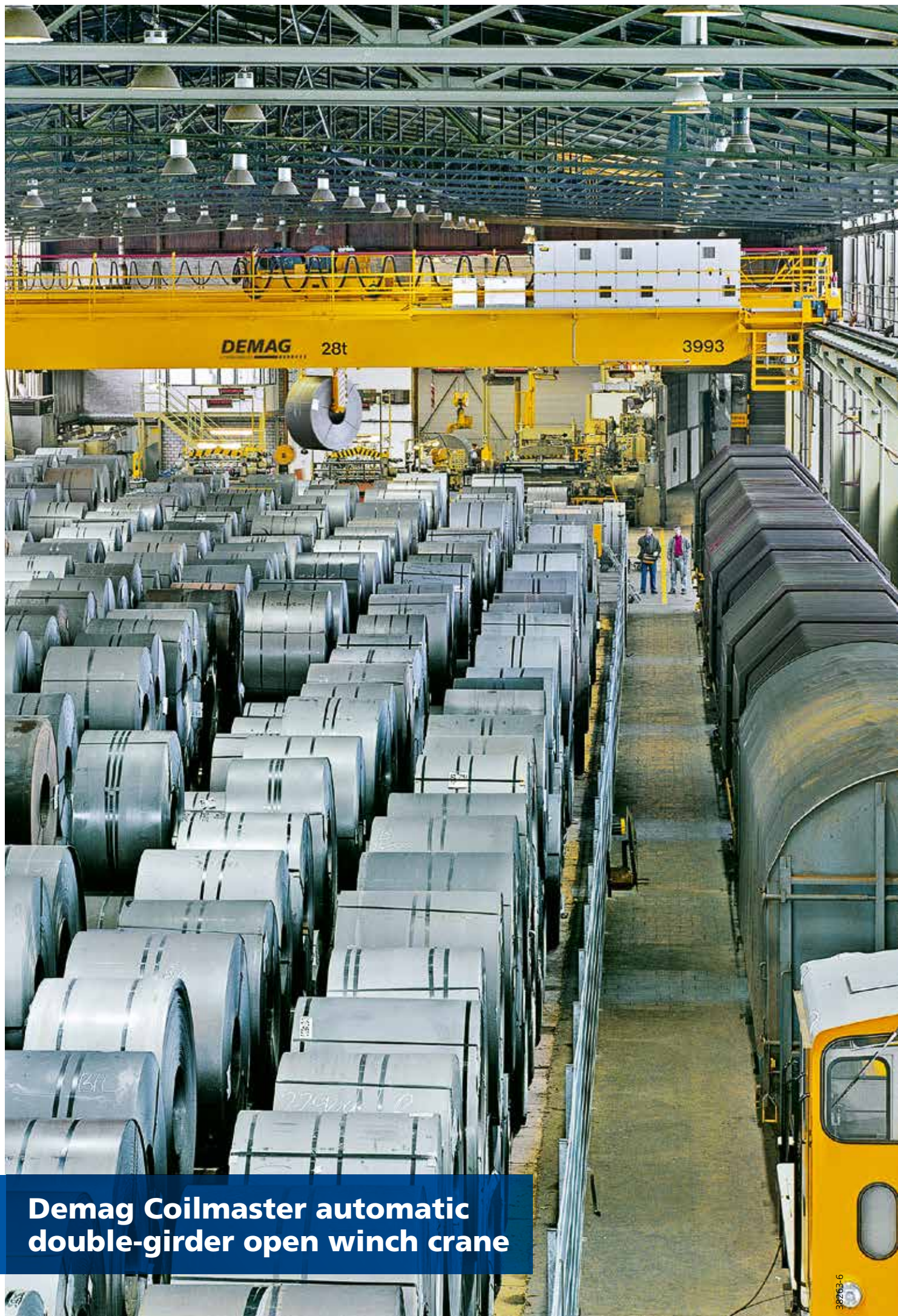
Demag Coilmaster automatic double-girder open winch crane