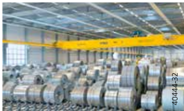
Fully automated coil store with magnets at Becker Stahlservice in Bönen, Germany