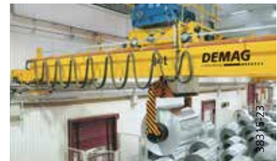
Automatic handling of aluminium coils at Pechiney Rhenalu in Rugles, France