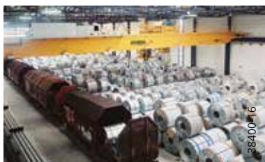
Just-in-time delivery to an automotive plant by Panopa in Wolfsburg, Germany